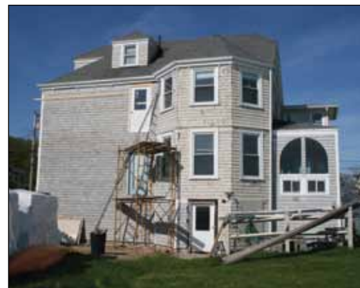
Strong Cottage is almost ready for its new fire escape.

Over in Smith House, new steel beams have replaced the sagging wooden beams that supported the second floor (even raising the floor a few inches in spots!), and both stairwells have been redesigned to make them safer in case of emergency.