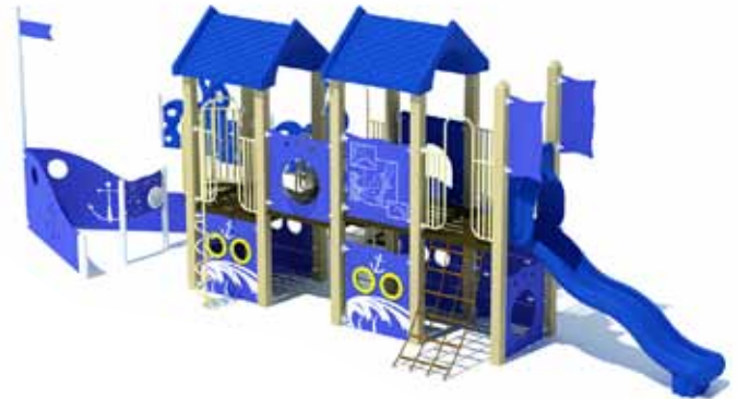
YOUNGER STRUCTURE: Featuring a nautical theme, complete with a custom KBIA flag, the area for younger children will include age-appropriate activities.