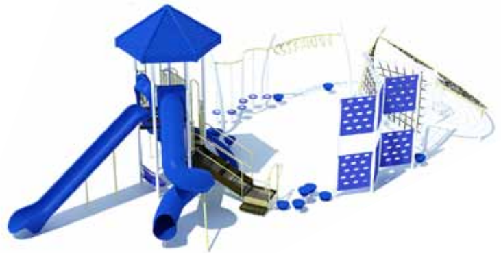
OLDER LOOP: The area for older children is an outdoor fitness obstacle course loop, which requires balance, climbing and overhead activities.

Next up, as part of our five-year 100th Anniversary Capital Campaign, KBIA is planning to replace our playground, beloved by the community but well past its useful lifespan. Last year the Board of Directors established a dedicated playground committee to study our options, with plans to break ground in 2013, pending funding. At a total replacement cost of $105,000, which includes a new fence, preliminary designs call for an area that is both fun and safe for children, yet attractive and fitting for this beach community. They are working on designs with clear lines of vision for parents and caretakers, while choosing structures that won't block neighbors' scenic views. As for color, current plans blend blue and tan equipment, inspired by its location in between the sand and the sea.