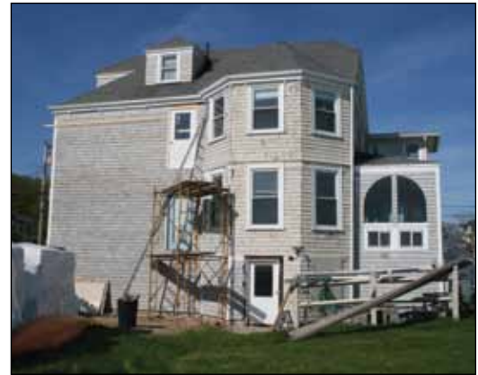
Strong Cottage is almost ready for its new fire escape.

Over in Smith House, new steel beams have replaced the sagging wooden beams that supported the second floor (even raising the floor a few inches in spots!), and both stairwells have been redesigned to make them safer in case of emergency.